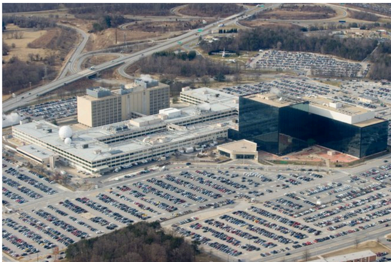
NSA Headquarters in Ft. Mead, Maryland.

Many of these actions, rulings and policies were kept secret from the American public.