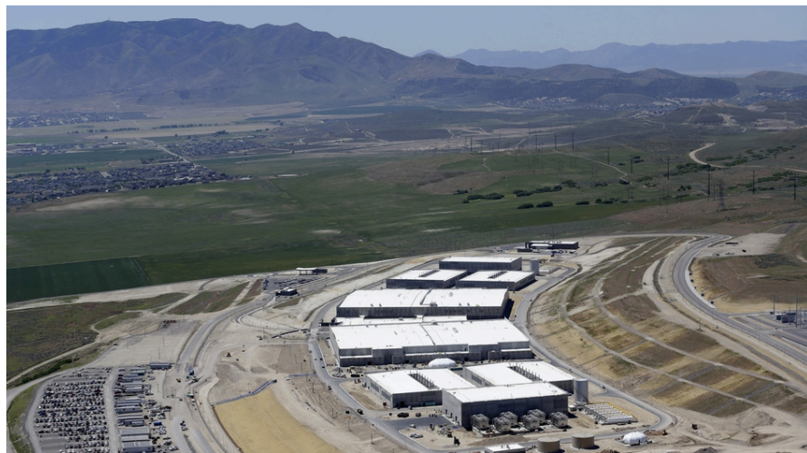
NSA data processing and storage facility near Bluffdale, Utah

Among the issues raised by U.S. government actions, legal rulings and policies following 9/11 are these: